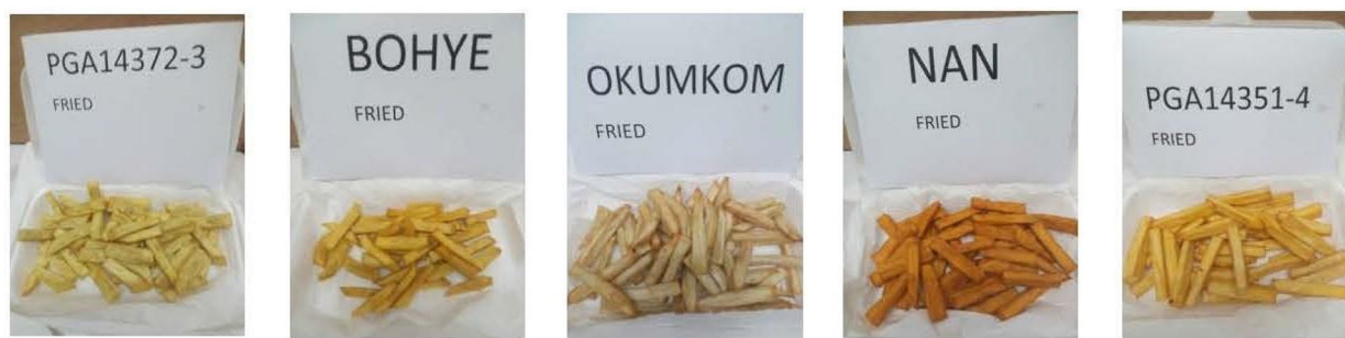
Figure 1 Pictures of fried sweetpotatoes used for DSA and Ghana market survey (NB: PGA14372-3 was recently released as SARI-Tiemeh). [Colour figure can be viewed at wileyonlinelibrary.com ]

Materials used for the market survey were described by the breeding programme as either sweet or low sweet types. While materials used for the community survey were rated for suitability for frying by focused group discussions (FGDs) as either most preferred, moderately preferred or least preferred. Colour measurement was by visual observation as employed by CIP-Ghana.